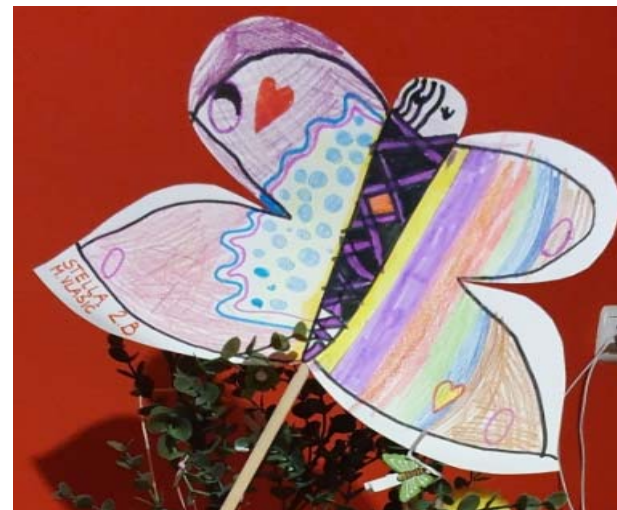
STELLA MRĐA VLAŠIČ, 2. B