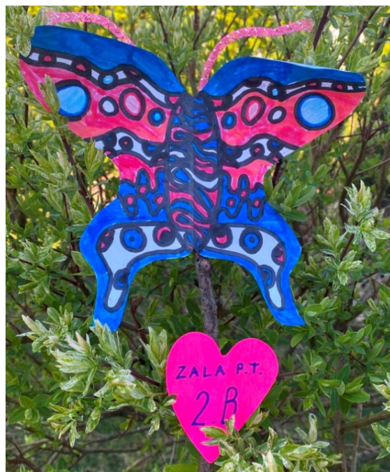
ZALA PETERLIN TASEV, 2. B