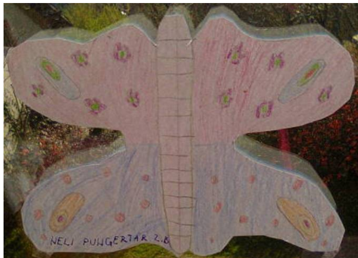
NELI PUNGERTAR, 2. B