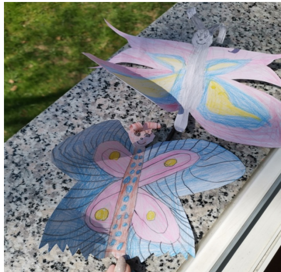
NIKOLAJ TRČEK, 2. B