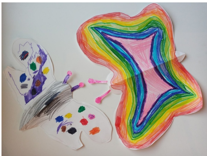
SILVESTRA IN AVRELIJA MOŠTROKOL, 2. B