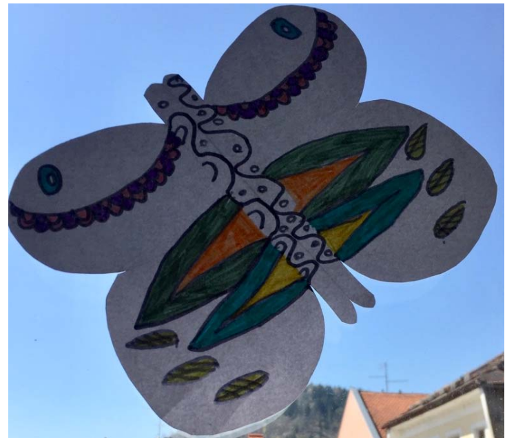
PAULINA OKORN, 2. B