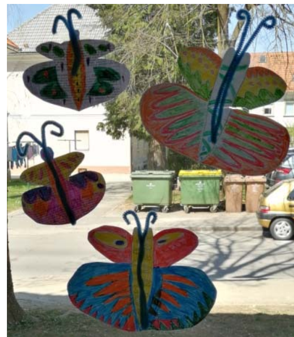
VID STANKIĆ, 2. B