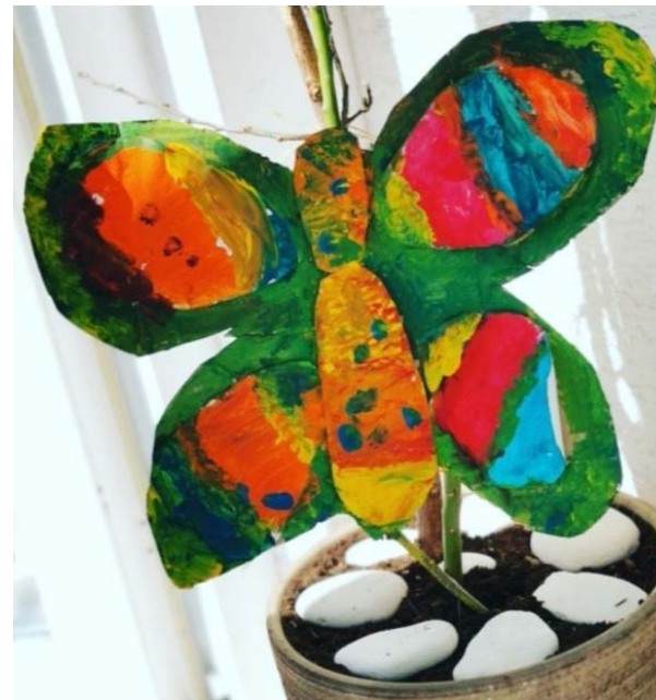
GAL PIPAN, 2. B