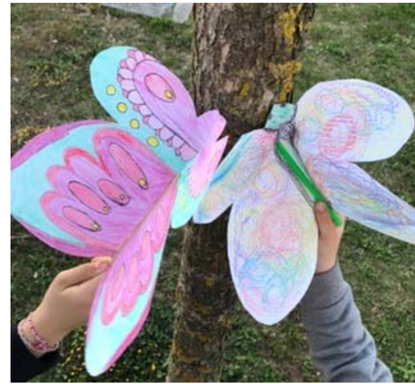
INA MITROV, 2. B