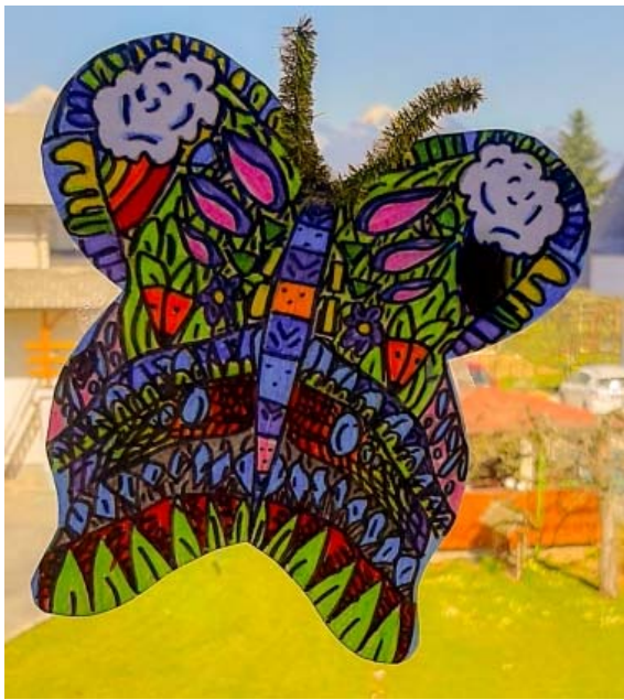
ELENA DOBRNJAC, 2.