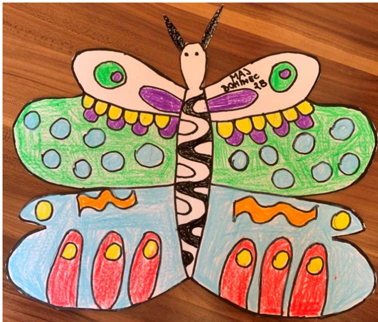
MAJ BOHINEC, 2. B